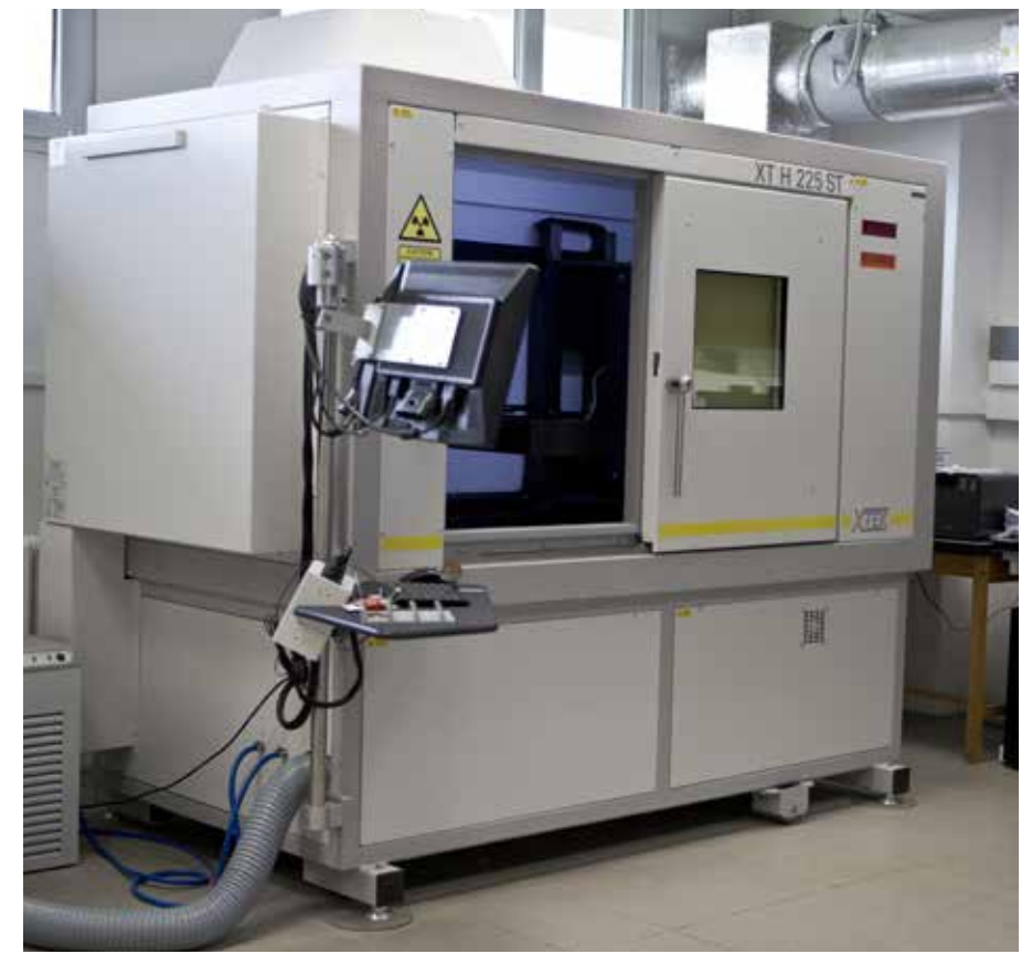
The XT H 225 ST X-ray CT system

The Laboratory of X-ray computer tomography was established in 2012 within the framework of the Institute of Clean Technologies for Extraction and Use of Energy Resources, based on an agreement among VŠB TU Ostrava, Faculty of Mining and Geology and a partner Institute of Geonics of the Academy of Sciences of the Czech Republic. The importance of the workplace lies above all in the possibility of non-destructive way of analysis and study of internal construction and time-space changes in different types of geomaterials in relation to the influence of external factors. The workplace is equipped with the two X-ray micro-focal industrial